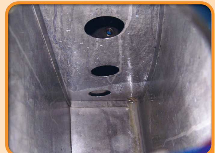
The sealing has created a shiny new "tank within the tank!" Suddenly this old tank looks new!