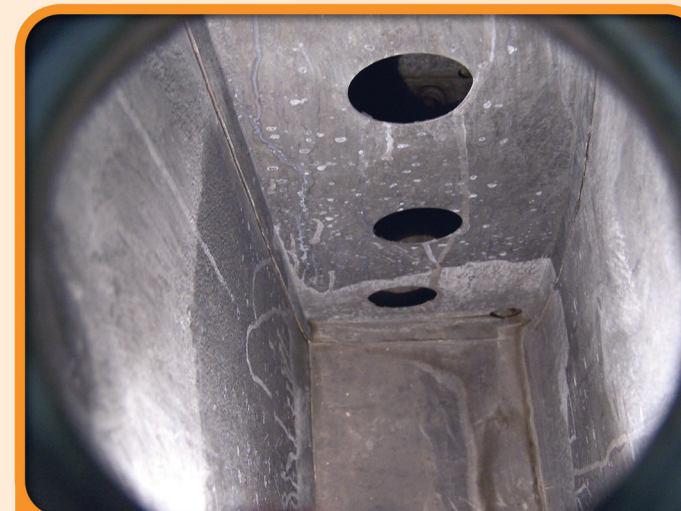
The rust converter in high concentration creates a thicker rust-retarding layer.