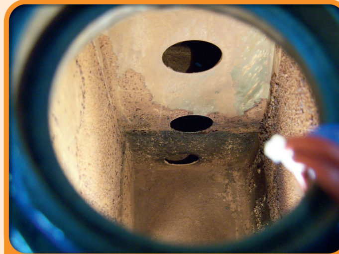
Rusty tank (1936 model) before treatment