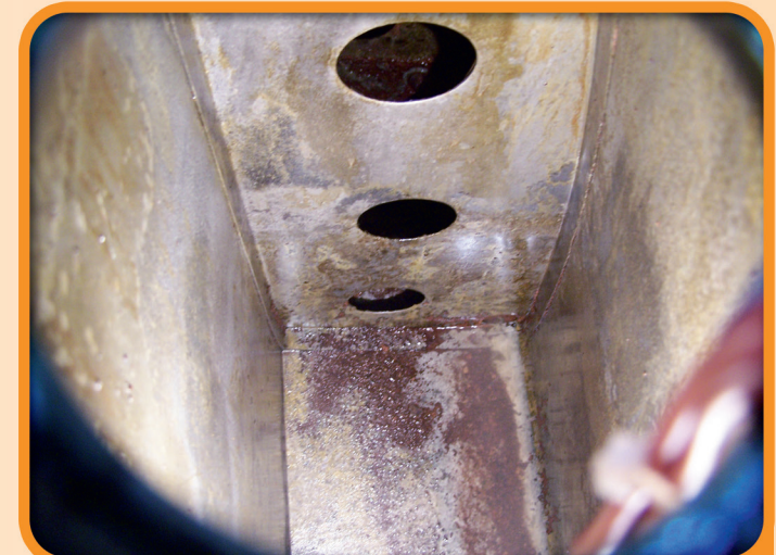
The dissolved rust and the dirt are washed out with water.