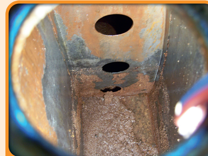
WAGNER rust converter dissolved the coarse rust within 72 hours.